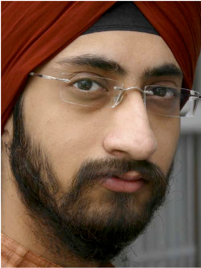
Spot the Terrorist - picture card E