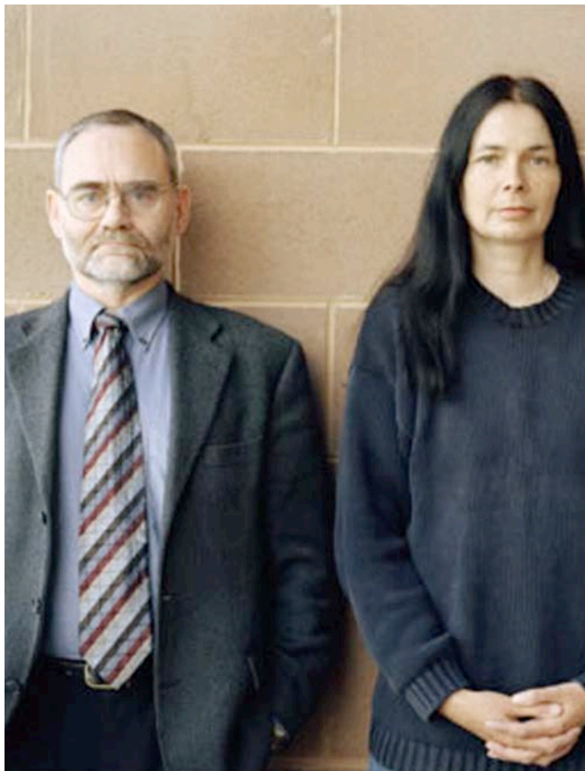
Spot the Terrorist - picture card C