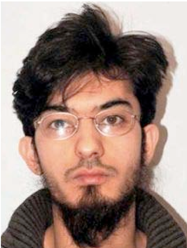
Spot the Terrorist - picture card G