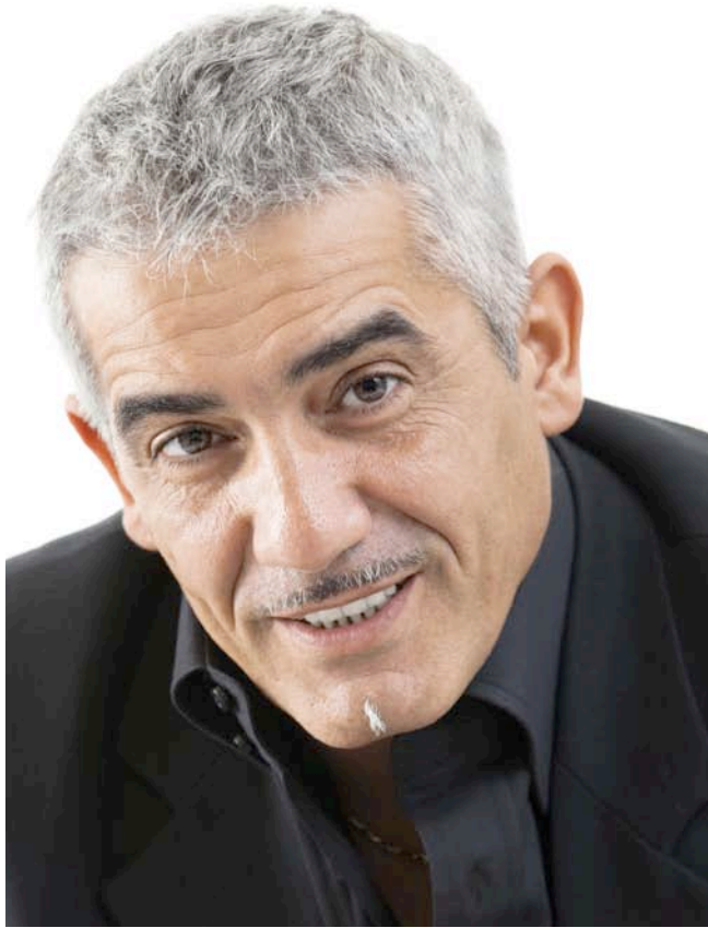
Spot the Terrorist - picture card A