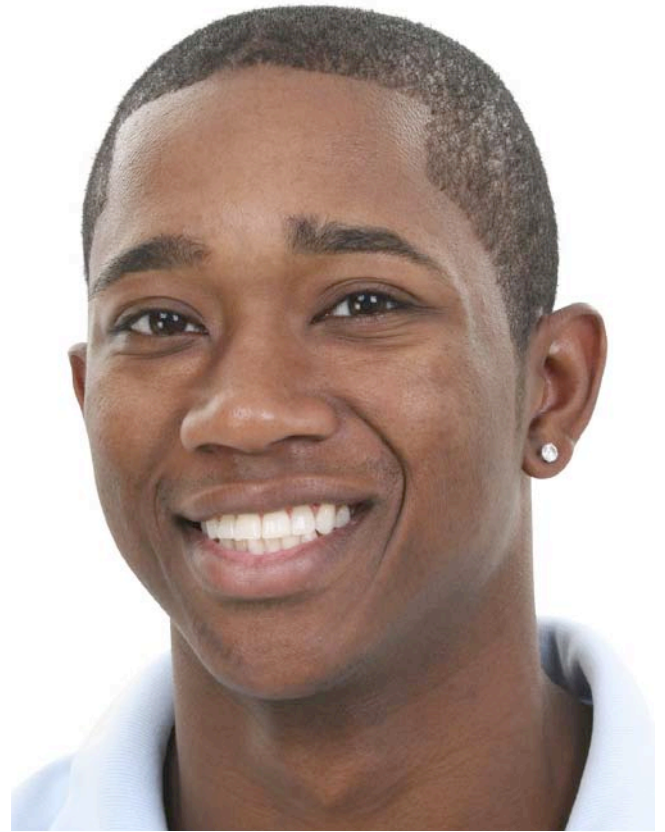
Spot the Terrorist - picture card B